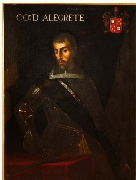
10 Feliciano de Almeida, Matias de Albuquerque (1595?-1647), 1673-1675. Gallerie degli Uffizi, Florence